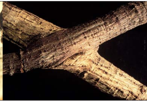
Figure 7 (David French, with permission).

sever the graft. Furthermore, walkways, paths, and roads must also be considered appropriately, as tree roots commonly grow under them. Due to all of these potential obstacles to proper trenching, it is advisable to undertake such operations under the supervision of tree care professionals with expertise in the management of oak wilt.