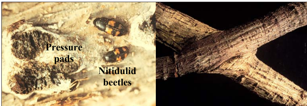
Figure 6 (David French, with permission).