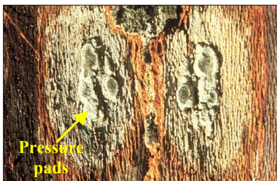
Figure 4 (David French, with permission).

In order to properly manage oak wilt it is essential to understand its cycle. The pathogen spreads from diseased to healthy trees in two ways: overland and underground. Overland spread is mediated mainly by sap feeding (a.k.a. picnic) beetles (Coleoptera: Nitidulidae). However, there is some evidence that oak bark beetles (Coleoptera: Scolytidae) may also be involved. Nitidulids are attracted by chemicals emanating from the fungal mats described above. Once on the mats (Fig. 6), the beetles pick up fungal spores and can carry them, sometimes over distances of a few miles, to freshly wounded healthy trees (attracted by the smell of fresh sap). This results in new infections, thus closing the overland cycle. While insect spread is an important medium to long-range dispersal mechanism for this fungus, it is estimated that 90% of new infections occur between neighboring trees through root grafts (Fig. 7).