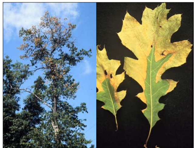
Figure 2 (David French, with permission).

Symptoms are typical of wilts (Fig. 2). Leaves usually begin withering in the upper canopy, producing “flags,” that is, whole branches or crown portions turning red-brown. Leaves of red oaks typically show yellowing and browning of the leaf margins (Fig. 3). White oak leaves usually show rather nondescript symptoms. Conversely, live oaks in the southern United States produce characteristic dead areas along the leaf veins. These dead areas generally expand until the whole leaf becomes brown. Eventually the leaves fall from the tree. If infections occur in late spring, trees usually begin wilting in midsummer to late summer, when the plants often are subjected to water deficit due to increased transpiration demand and decreased rainfall.