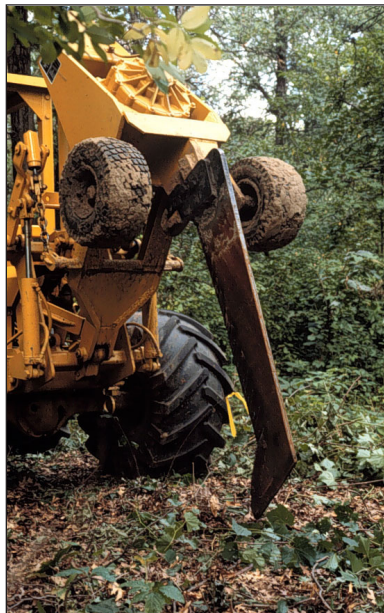
Figure 8 (Fred Baker, with permission).

Given the higher significance of underground spread, control of direct tree-to-tree transmission is much more important. Here, interruption of the disease cycle is accomplished by physically severing actual or potential root contacts between diseased and healthy trees. This is done by trenching or cutting through the soil with a trencher or vibratory plow. The latter is the preferred tool. Given the depth of oak root systems, it is advisable to use a 5 ft blade (Fig. 8). Trenching must always be done before the diseased or dead trees are cut for removal (see below), to avoid sudden water tension imbalances that might “suck” fungal material from the infected trees into the healthy trees through the common root system. Trenching should be conducted by advice of specialists. This is due to the importance of locating the trenches appropriately between diseased and healthy trees. When possible, a double trench defining a buffer band of apparently healthy trees between diseased and uninfected trees should be used (Fig. 9).