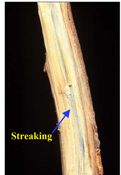
Figure 5.

In this case, the fungus grows down the trunk, into the roots of diseased trees, and then into healthy trees via the common root system. Once in the new tree the pathogen grows throughout the vascular system and spreads to other trees via the root system or the beetles. In this way, spread through root systems often results in disease centers that expand outward from the initially infected tree.